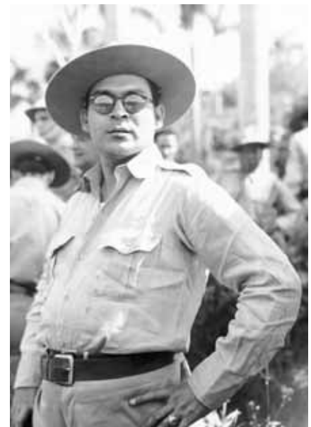
▲ Cuban dictator Fulgencio Batista circa 1935

By 1952 Batista felt sure enough of USA support to end the 'presidency' of Carlos Prío Socarrás with a military coup, pre-empting elections and taking over the government. This became the political trigger to the revolution.