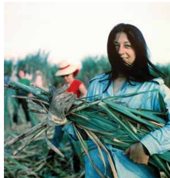
▲ Volunteers trying to reach their 10 million ton harvest target

Spanish word meaning ‘sugar-cane harvest’.