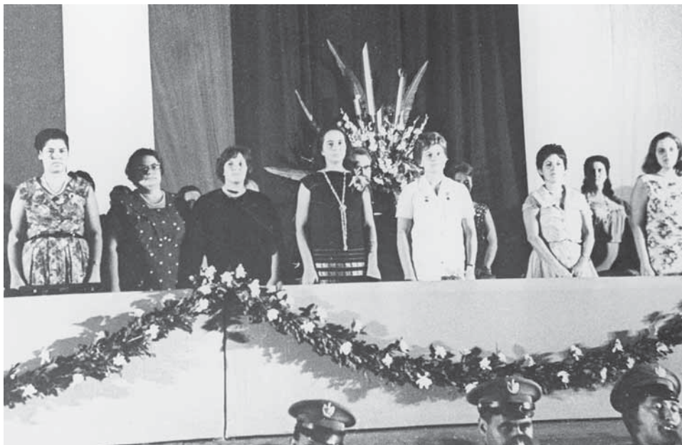
▲ Vilma Espín (centre, in plaid skirt), President of the Federation of Cuban Women, welcomes Soviet cosmonaut Valentina Tereshkova, 1 November 1973