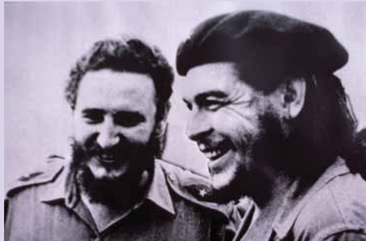
▲ Fidel Castro and Che Guevara

What does this photograph convey about Castro and Guevara?