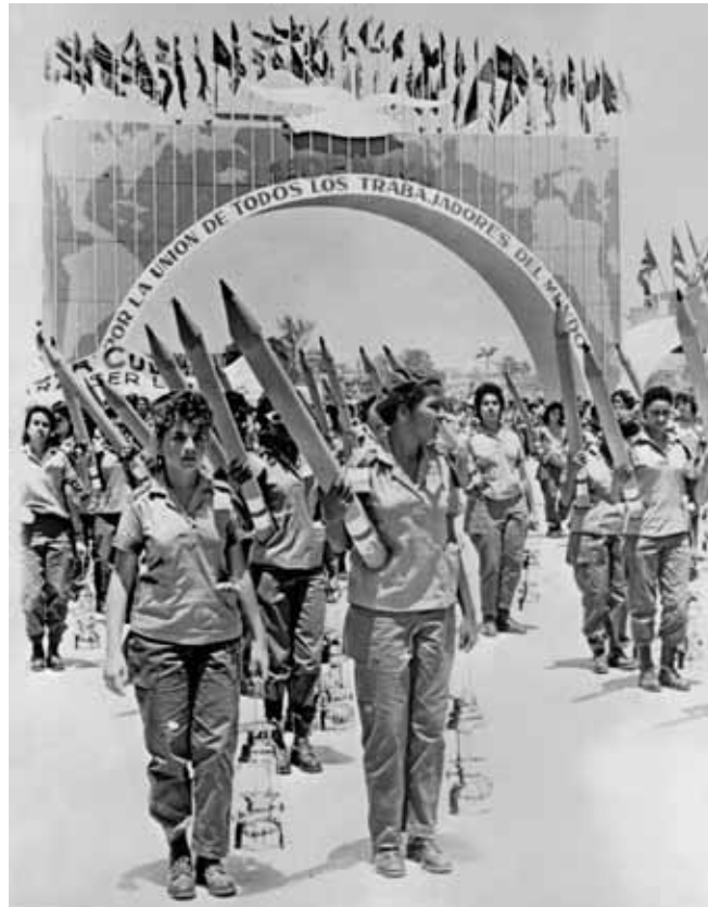
▲ Young women working for a literacy campaign, parading with big pencils in the streets of La Havana during the Cuban Revolution, 1 May 1961

Castro's social programmes were definitely in favour of the working classes. A countrywide literacy campaign, where students and literate volunteers travelled to rural locations in 1961 to teach other Cubans how to read and write, became emblematic of the first social policies of the revolutionary government. New schools were built and teacher-training institutes founded. The campaign was a resounding success and increased the government's popularity. Other popular measures included building rural hospitals and clinics and opening private beach resorts to the public. Even so, despite an initial rise in wages, living standards became uniformly low.