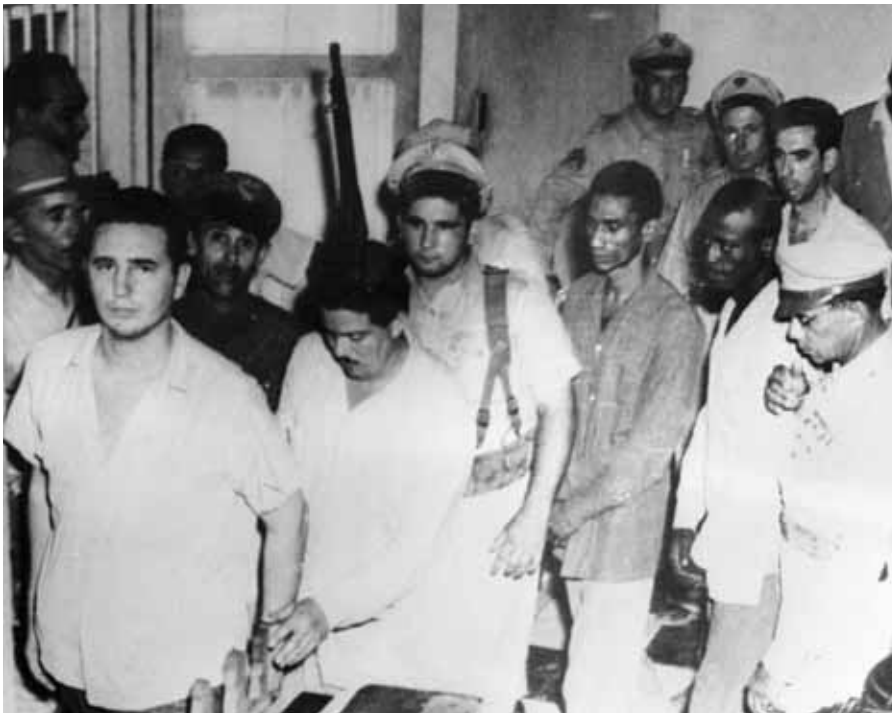
▲ Fidel Castro (on the left) and his companions being conveyed to Vivac prison in Santiago de Cuba, 1953

The revolt failed; some rebels were killed and others imprisoned. Castro and his group used the ensuing trial to expound on the corruption of the government. Castro used his oratory skills in an impassioned speech titled 'History will absolve me'. Nonetheless, he was found guilty and jailed until 1955, when he was exiled to Mexico. The exiles now called themselves 'The 26th of July Movement, (M-26-7)' in remembrance of the failed Moncada attack.