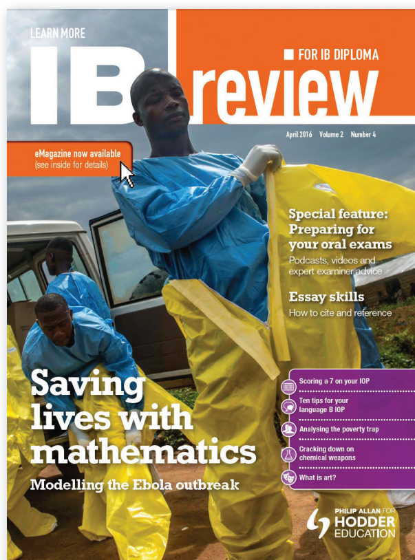
IB review, April 2016