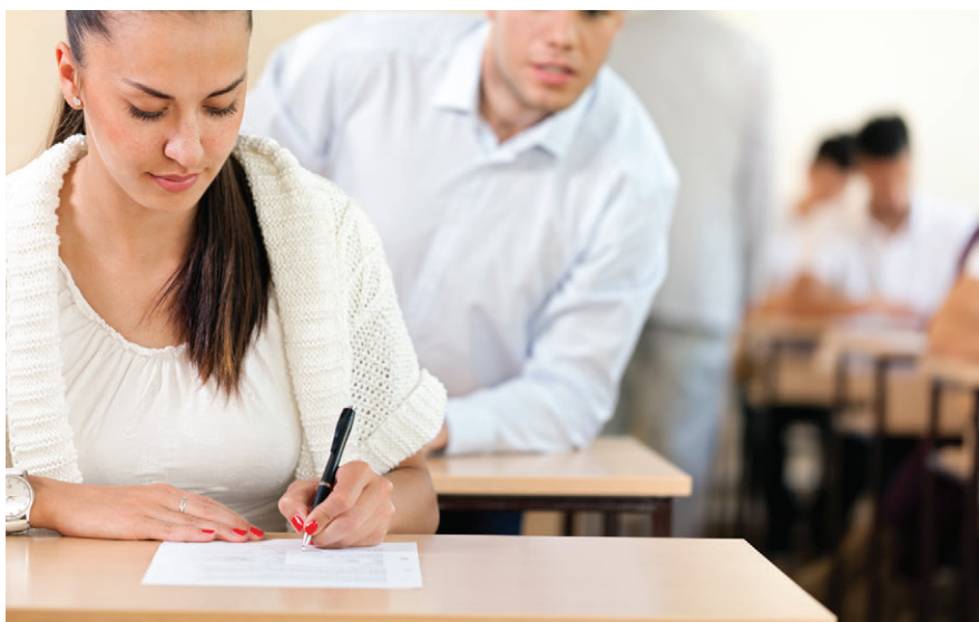
Copying the work of others is academically dishonest

In many schools, formal assessments (such as Internal Assessments, EEs and written assignments) are submitted to plagiarism-detection software, such as Turnitin. A high text match may warrant further investigation by the school and IB Diploma Programme Coordinator.